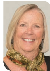
Pegi Ard Opportunity