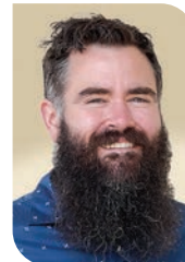
Spenser Russell Community