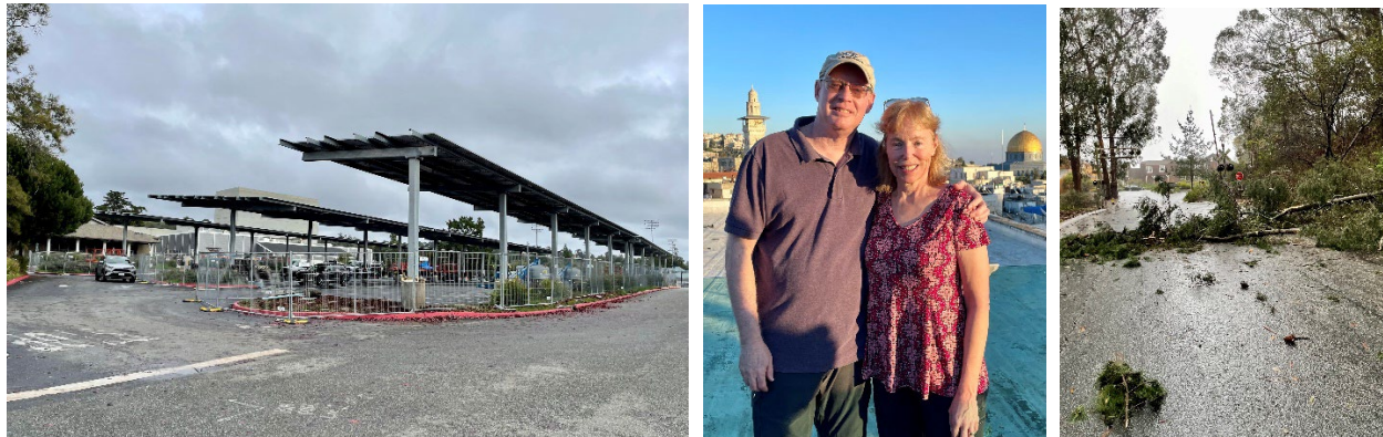
The solar parking lot project is under way at Cabrillo (behind VAPA); A photo from Jerusalem; Storm damage near my home on Dec. 30, 2022

ended with a rainy drive back to La Selva Beach, where I discovered that the recent storm had knocked down a tree just 100 yards from my home. After about 45 minutes of debris removal and hauling limbs to the side of the road, I was finished with my work-out for the day!